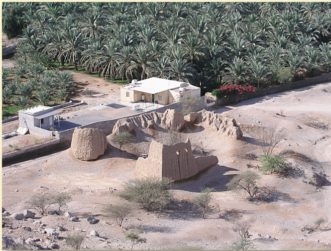
The lower fort