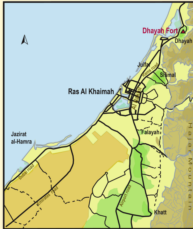
Location of Dhayah Fort