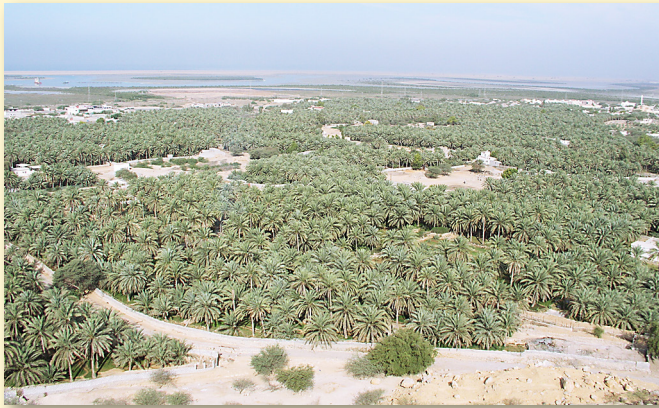
The palm gardens below the fort