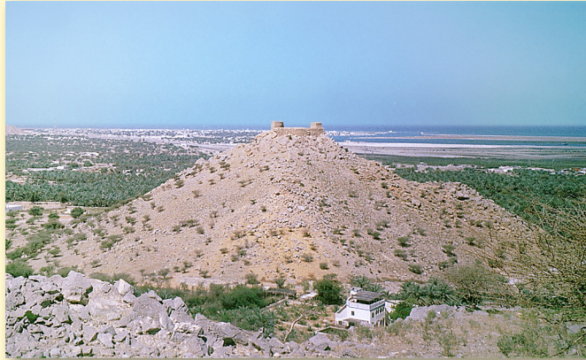
Dhayah with hill, fort and palm gardens

With a backdrop of steep mountains, the bay of Dhayah has always been a very fertile area and has been settled in at least since the third millennium BC.