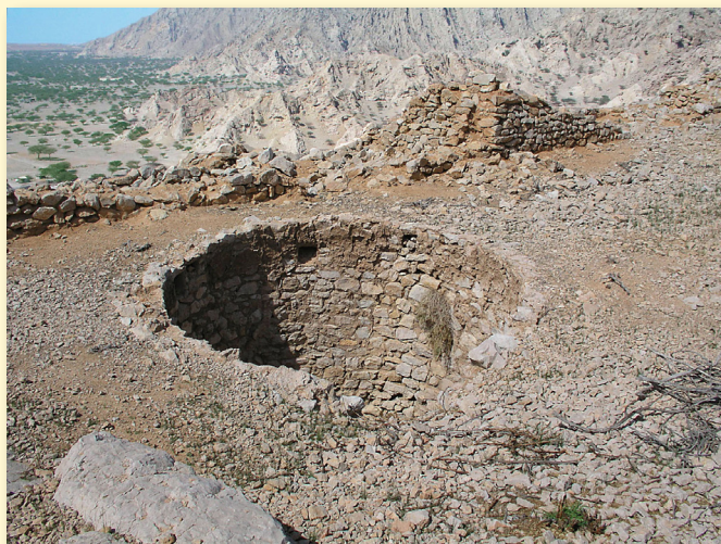
Another cistern in the upper terrace