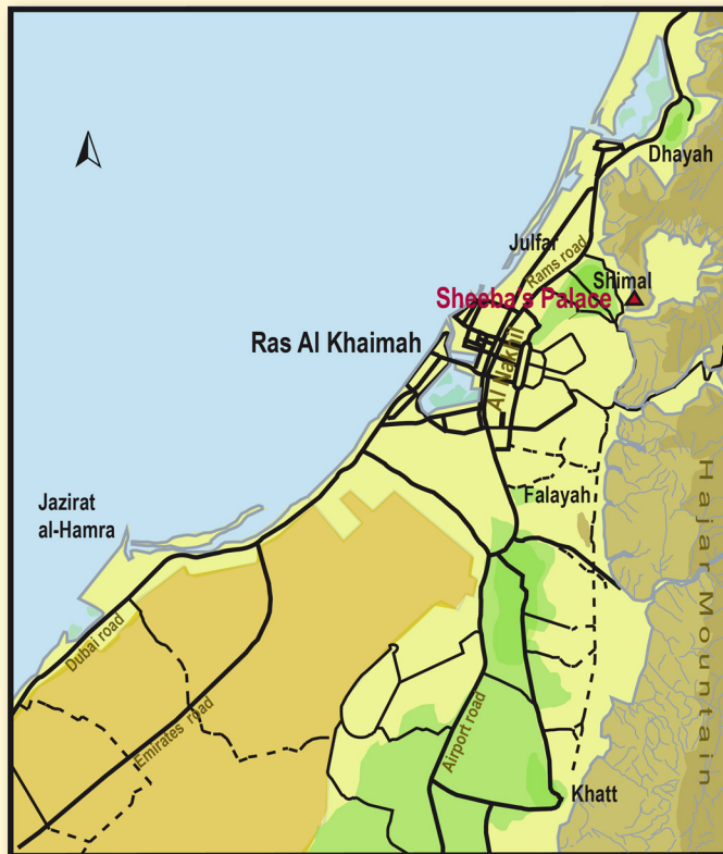
Location of the Queen of Sheeba's Palace