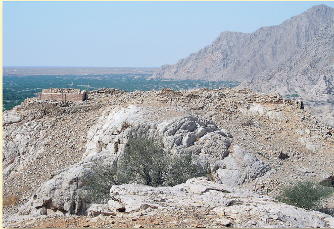
The palace area seen from the south

T his medieval palace is situated on a ridge above the village of Shimal.