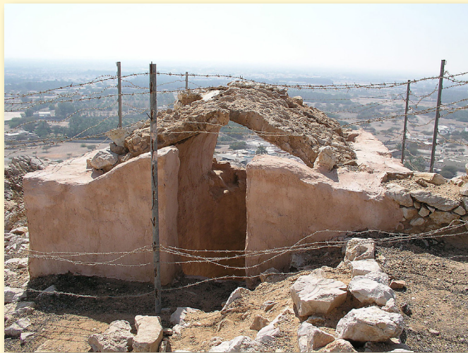
The roofed cistern