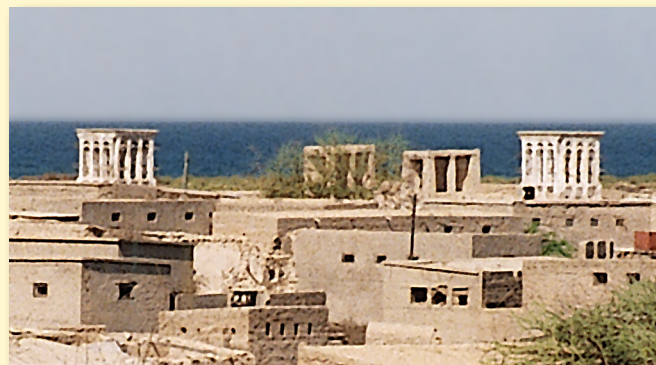
The windtower house seen from the fort

The Mosque with a special Minaret — Of the several mosques this one is outstanding due to its special minaret. Situated close to the market area and former seashore, it captured the cool breeze coming in from the sea. Its