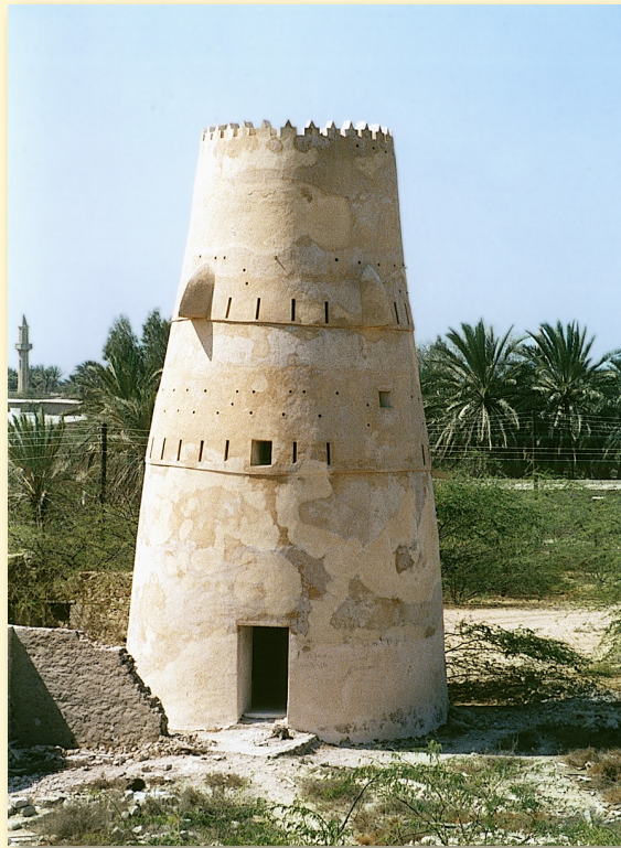
The round tower of the fort