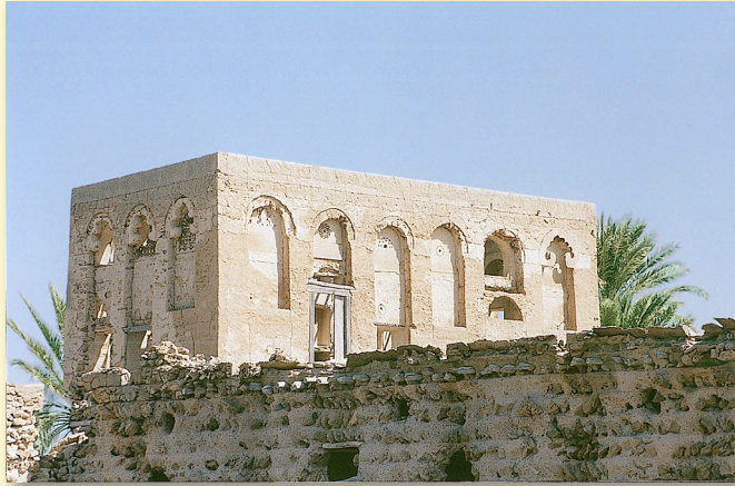
Pearl merchants residence