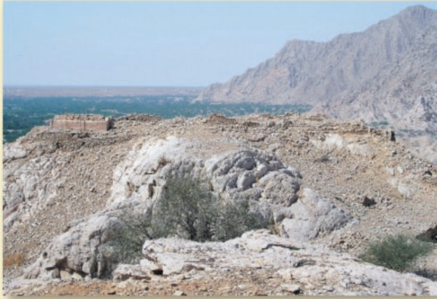
The palace area seen from the south

This medieval palace is situated on a ridge above the village of Shimal.