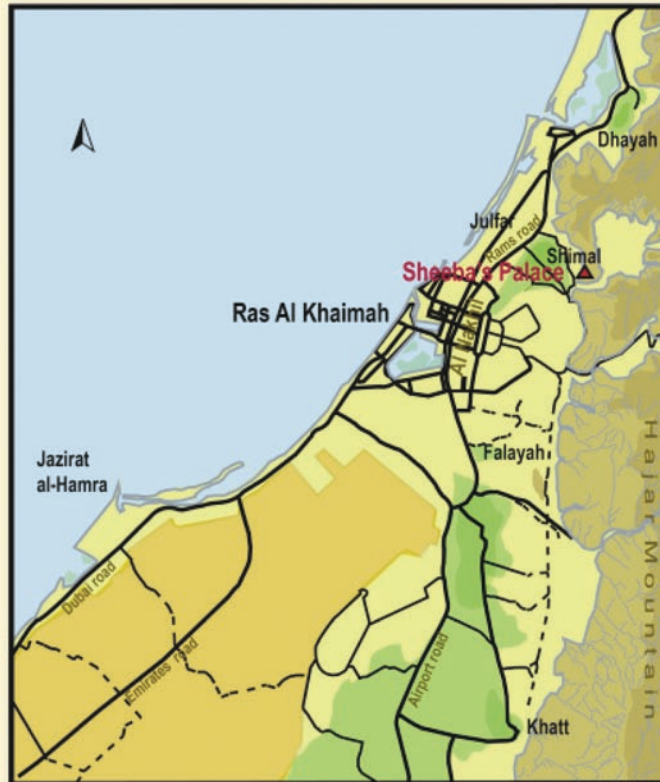
Location of the Queen of Sheeba's Palace