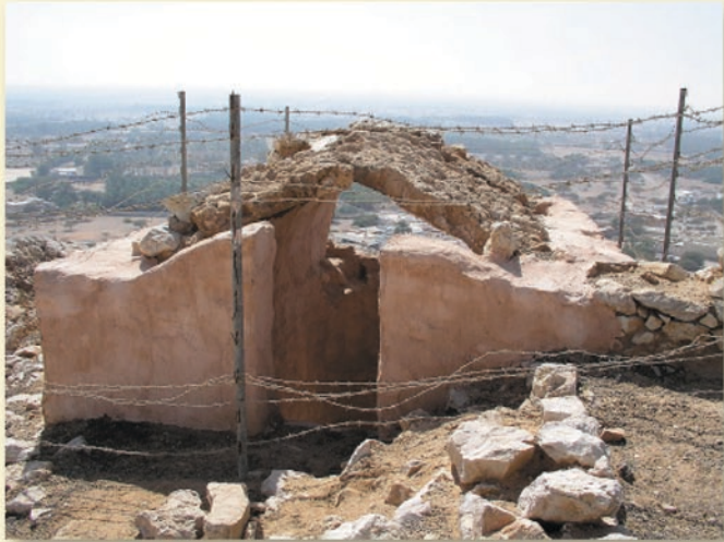
The roofed cistern