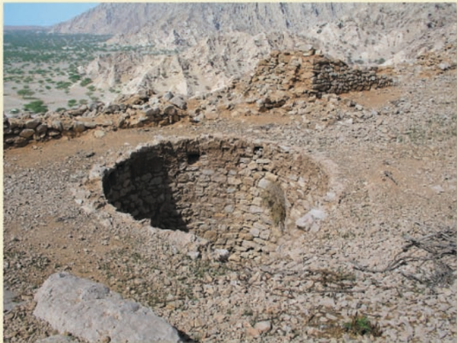
Another cistern in the upper terrace